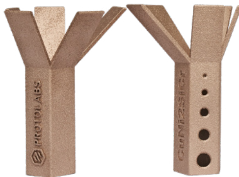
High Resolution 20 µin