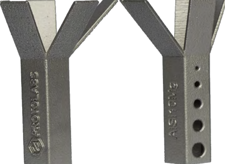
Normal Resolution 60 µm