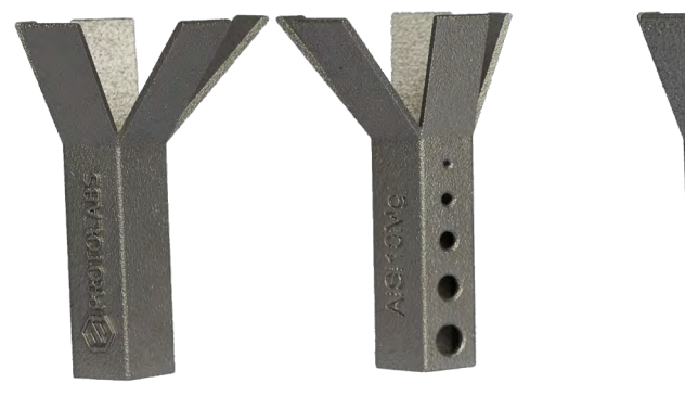
High Resolution 30 µm