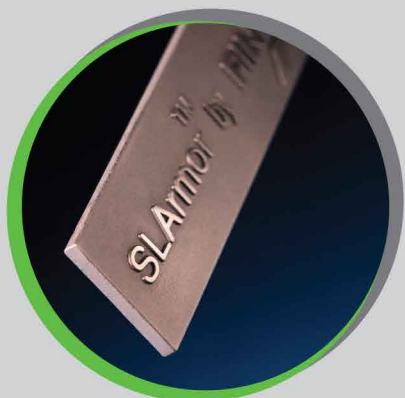
Flat, medium gray matte