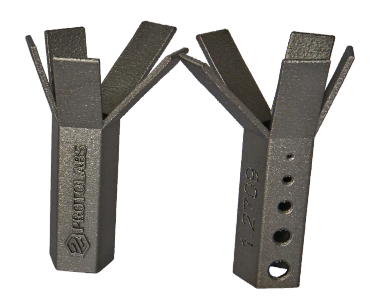
Normal Resolution 60 µm